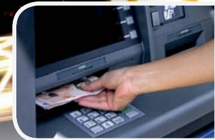
Retail and Banking