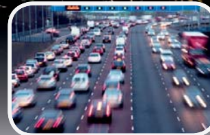
Intelligent Traffic Systems